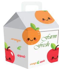
good things comes in small packages