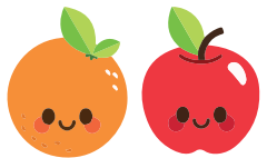
freshness & health